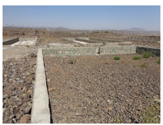
Photo: A completed Sludge Drying Bed in Welenchiti town, Oromia Region.

Technical trainings have also been implemented to support PPOs' operations at landfills and drying bed sites to ensure that these facilities are managed sustainably in an environmentally acceptable manner. This technical training package included: (a) preparation of site-specific practical operation and management manuals and (b) provision of hands-on training to the operators responsible for managing the collection, transportation and disposal of the different wastes.