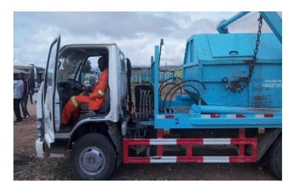
Photo: A skip loader operating a mechanical arm to lift and transport 5 m<sup>3</sup> garbage bins to landfill sites. (Photo by UNICEF, May 2017)

Tariff settings, subsidy options, operational arrangements and institutional arrangements have not been imposed by the ONEWASH Plus programme, but have been developed following the existing trends and directions given by town administrations and users.